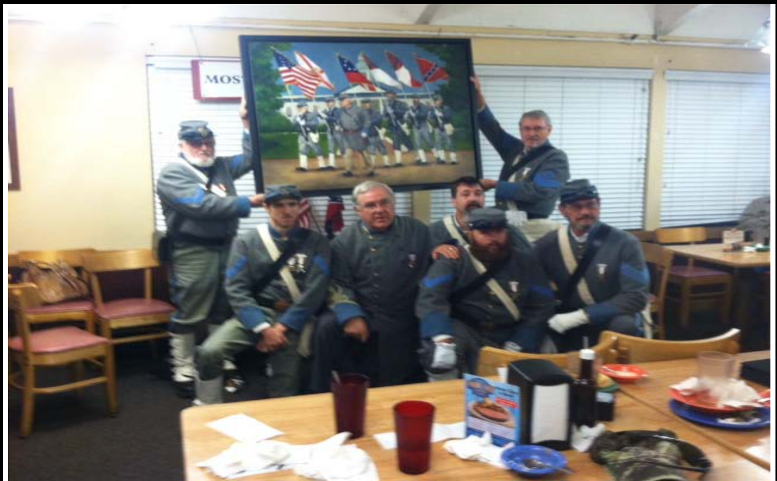
The Finley's Brigade Color/Honor Guard posing with their painting.