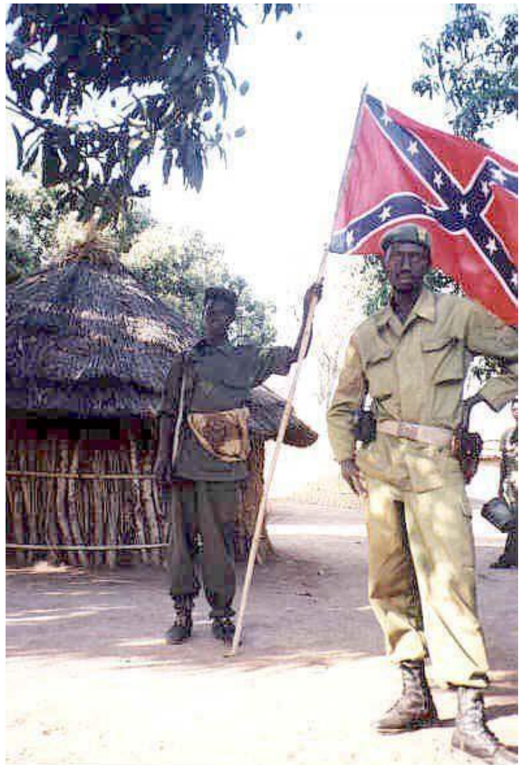
African Christian freedom fighters holding the St. Andrews Cross while defending their families.